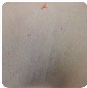
After 3 treatments