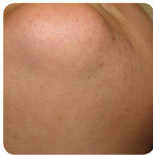
After 3 treatments