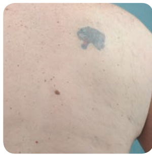
After 3 treatments